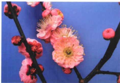
图 376: '重瓣粉朱'梅:真梅品种群。武汉中国梅花研究中心保存。国际登录号:2003。 'Chongban Fenzhu' Mei (double pinkish-red): True Mume Group, preserved at Mei Flower Research Center of China, Wuhan, China. Intern. Reg. No. 2003.

注: 为配合梅品种国际登录年报,本刊自 2004 年第 1 期起连续登载“梅品种国际登录”彩照,现因故从 2008 年起暂时中止一年,以后再继续刊登梅品种彩照,特此说明。