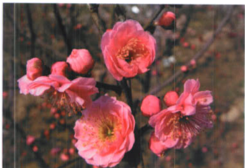
图 354: '八重关守'梅:真梅品种群。无锡梅园保存。国际登录号:2601。 'Bachong Guanshou' Mei (eight layers gate guard): True Mume Group, preserved at Wuxi Mei Garden, Wuxi, China. Intern. Reg. No. 2601.