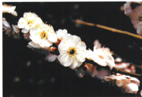
图 364: '早玉蝶'梅:真梅品种群。南京中山陵园梅园保存。国际登录号:2057。 'Zao Yudie' Mei (early jade butterfly): True Mume Group, preserved at Mei Garden of Dr. Sun Yatsen's Mausoleum, Nanjing, China. Intern. Reg. No. 2057.