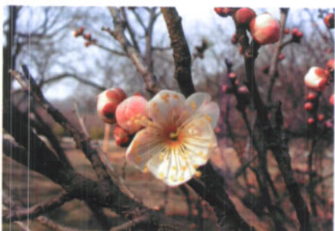
图 371: '粉晕江'梅:真梅品种群。南京中山陵园梅园保存。国际登录号:2021。 'Fenyun Jiang' Mei (pink-flushed Mei of Yangtze): True Mume Group, preserved at Mei Garden of Dr. Sun Yatsen's Mausoleum, Nanjing, China. Intern. Reg. No. 2021.