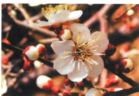
图 359: '米良'梅:真梅品种群。北京植物园保存。国际登录号:2429。 'Mi Liang' Mei (nice rice): True Mume Group, preserved at Beijing Botanical Garden, Beijing, China. Intern. Reg. No. 2429.