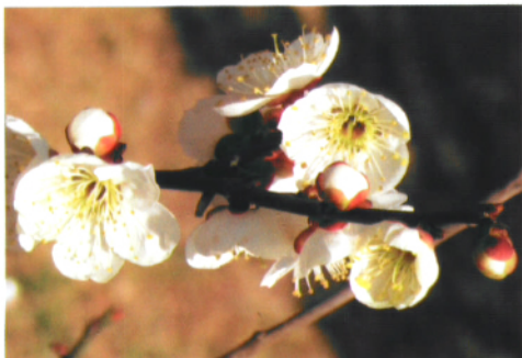
图 360: '雪月花'梅:真梅品种群。北京植物园保存。国际登录号: 2445。 'Xue Yue Hua' Mei (snow moon and flower): True Mume Group, preserved at Beijing Botanical Garden, Beijing, China. Intern. Reg. No. 2445.