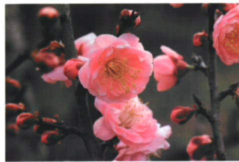
图 367: '密丛晚粉'梅:真梅品种群。南京中山陵园梅园保存。国际登录号:2039。 'Micong Wanfen' Mei (dense-flowered bushy late pink): True Mume Group, preserved at Mei Garden of Dr. Sun Yatsen's Mausoleum, Nanjing, China. Intern. Reg. No. 2039.