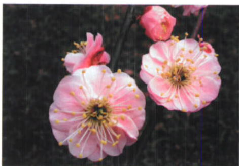
图 372: '粉口'梅:真梅品种群。武汉中国梅花研究中心保存。国际登录号:2017。 'Fenkou' Mei (powdery mouth): True Mume Group, preserved at Mei Flower Research Center of China, Wuhan, China. Intern. Reg. No. 2017.