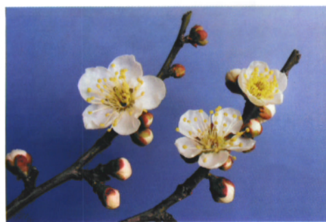
图 366: '磨山小'梅:真梅品种群。武汉中国梅花研究中心保存。国际登录号:2043。 'Moshan Xiao' Mei (Moshan small Mei): True Mume Group, preserved at Mei Flower Research Center of China, Wuhan, China. Intern. Reg. No. 2043.