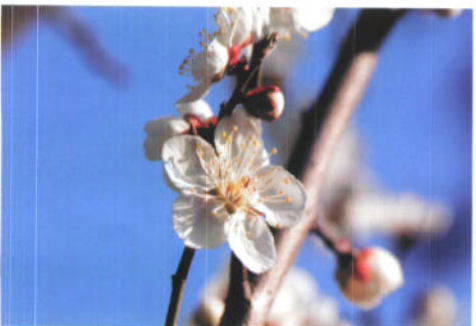
图 374: '单瓣早白'梅:真梅品种群。南京中山陵园梅园保存。国际登录号:2006。 'Danban Zao Bai' Mei (single-petalled early white): True Mume Group, preserved at Mei Garden of Dr. Sun Yatsen's Mausoleum, Nanjing, China. Intern. Reg. No. 2006.