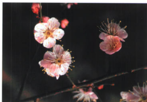
图 373: '粉瓣'梅:真梅品种群。南京中山陵园梅园保存。国际登录号:2015。 'Fen Ban' Mei (pink petal): True Mume Group, preserved at Mei Garden of Dr. Sun Yatsen's Mausoleum, Nanjing, China. Intern. Reg. No. 2015.