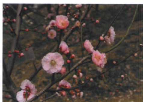
图 353: '巨人竜'梅(卧竜):真梅品种群。无锡梅园保存。国际登录号:2650。 'Ju Ren Long' Mei (giant man dragon): True Mume Group, preserved at Wuxi Mei Garden, Wuxi, China. Intern. Reg. No. 2650.