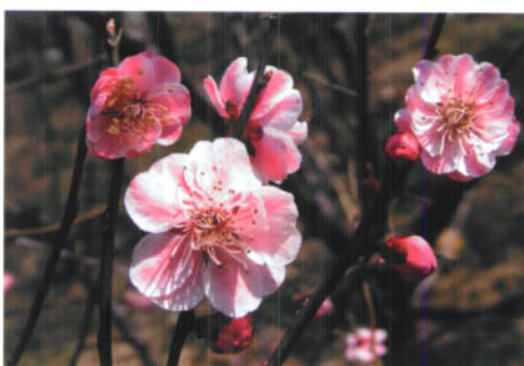
图 355: '八重铃鹿'梅:真梅品种群。无锡梅园保存。国际登录号:2602。 'Bachong Linglu' Mei (eight layers bell deer): True Mume Group, preserved at Wuxi Mei Garden, Wuxi, China. Intern. Reg. No. 2602.