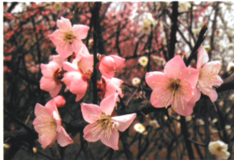
图 361: '书屋之蝶'梅:真梅品种群。无锡梅园保存。国际登录号: 2435。 'Shuwu Zhi Die' Mei (butterfly in study): True Mume Group, preserved at Wuxi Mei Garden, Wuxi, China. Intern. Reg. No. 2435.