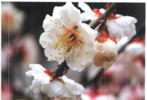
图 357: '皱瓣垂枝'梅:真梅品种群。南京中山陵园梅园保存。国际登录号:2663。 'Zhouban Chuizhi' Mei (wrinkled-petal pendant): True Mume Group, preserved at Mei Garden of Dr. Sun Yatsen's Mausoleum, Nanjing, China. Intern. Reg. No. 2663.