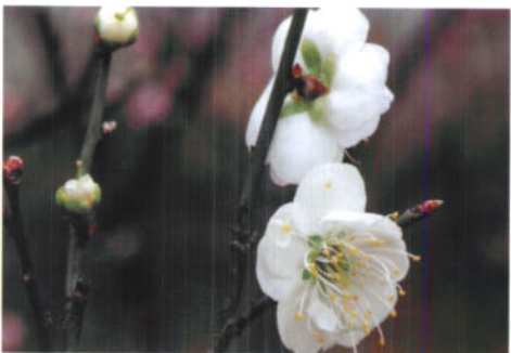
图 375: '长蕊绿萼'梅:真梅品种群。南京中山陵园梅园保存。国际登录号:2001。 'Chang Rui Lu'e' Mei (long-stamen green calyx): True Mume Group, preserved at Mei Garden of Dr. Sun Yatsen's Mausoleum, Nanjing, China. Intern. Reg. No. 2001.