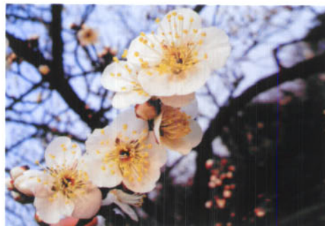
图 369: '江梅':真梅品种群。武汉中国梅花研究中心保存。国际登录号:2029。 'Jiang Mei' (Mei of Yangtze): True Mume Group, preserved at Mei Flower Research Center of China, Wuhan, China. Intern. Reg. No. 2029.