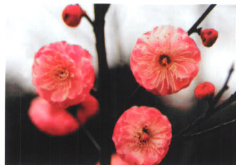
图 370: '红艳宫粉'梅:真梅品种群。武汉中国梅花研究中心保存。国际登录号:2028。 'Hongyan Gongfen' Mei (brilliant red palace pink): True Mume Group, preserved at Mei Flower Research Center of China, Wuhan, China. Intern. Reg. No. 2028.