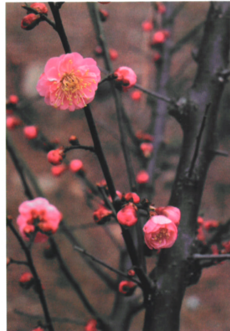
图 365: '桃干小宫粉'梅:真梅品种群。青岛梅园保存。国际登录号:2045。 'Taogan Xiao Gongfen' Mei (peach trunk little palace pink): True Mume Group, preserved at Qingdao Mei Garden, Qingdao, China. Intern. Reg. No. 2045.