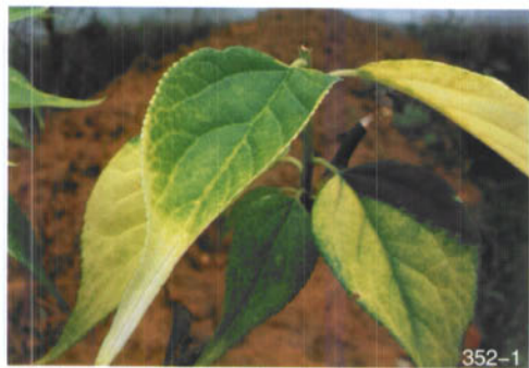
图 352: '锦叶绿萼'梅:真梅品种群。南京中山陵园梅园保存。国际登录号:2625。 'Jinye Lue' Mei (versicolor leaves duplicate green calyx): True Mume Group, preserved at Mei Garden of Dr. Sun Yatsen's Mausoleum, Nanjing, China. Intern. Reg. No. 2625.