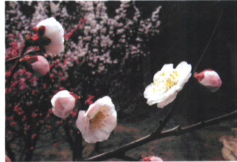
图 362: '熏之大和'梅:杏梅品种群。无锡梅园保存。国际登录号: 2446。 'Xun Zhi Da He' Mei (fumigation with great harmony): Apricot Mei Group, preserved at Wuxi Mei Garden, Wuxi, China. Intern. Reg. No. 2446.