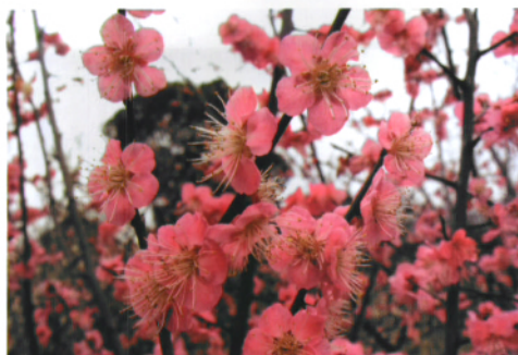
图 363: '肥后自慢赤'梅:真梅品种群。无锡梅园保存。国际登录号:2413。 'Feihou Zi Man Chi' Mei (proud red in Feihou): True Mume Group, preserved at Wuxi Mei Garden, Wuxi, China. Intern. Reg. No. 2413.