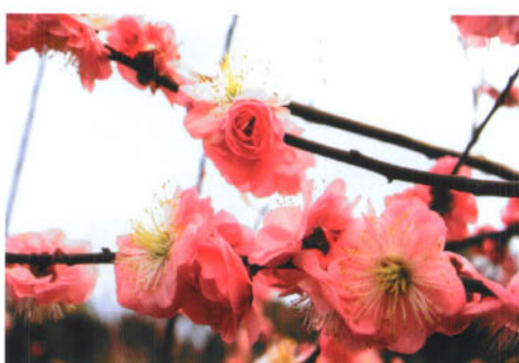
图 356: '坂入八房'梅:杏梅品种群。无锡梅园保存。国际登录号:2603。 'Ban Ru Ba Fang' Mei (shope enter eight house): Apricot Mei Group, preserved at Wuxi Mei Garden, Wuxi, China. Intern. Reg. No. 2603.